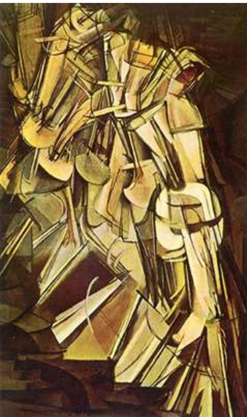
Nude Descending A Staircase (1912) Marcel Duchamp