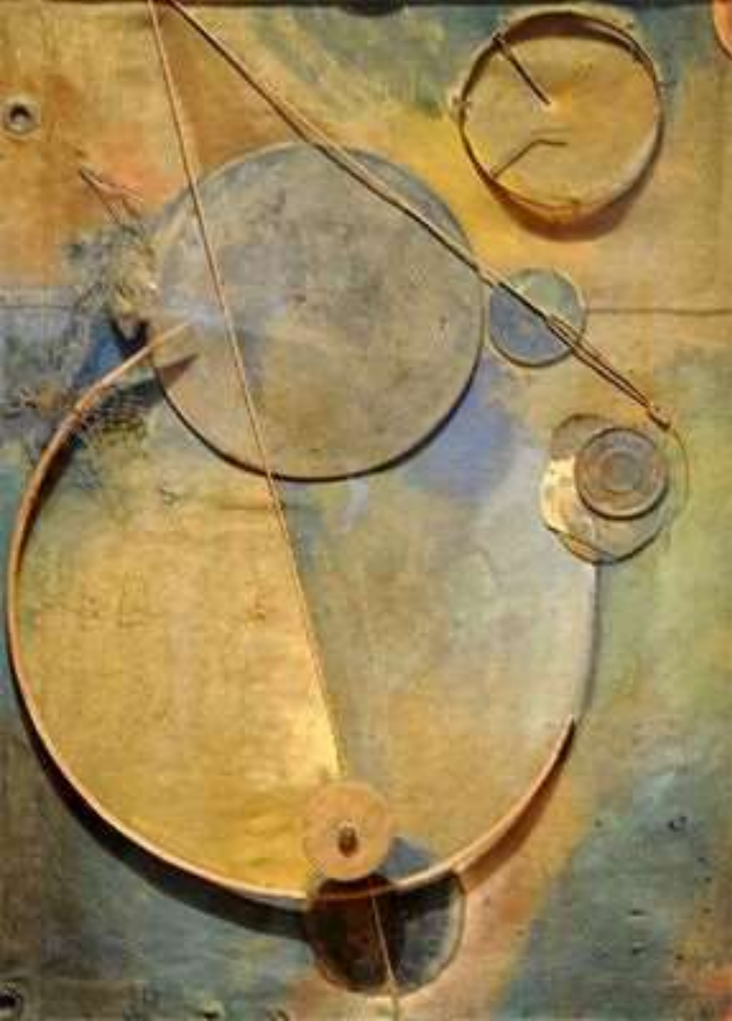
Revolving (1919) Kurt Schwitters