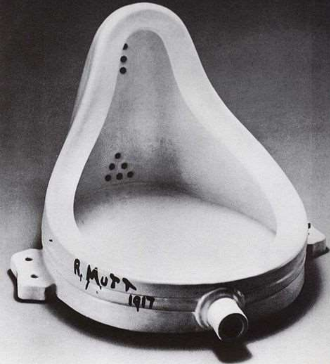
Fountain (1917) Marcel Duchamp